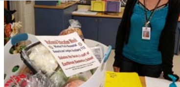
fruits and veggies.