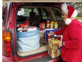
project. The Post funded one of the baskets and the Auxiliary funded the