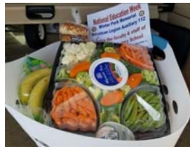
cheese, and assorted